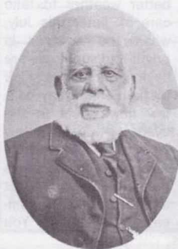
Pio de Jesus Pico 1801-1894